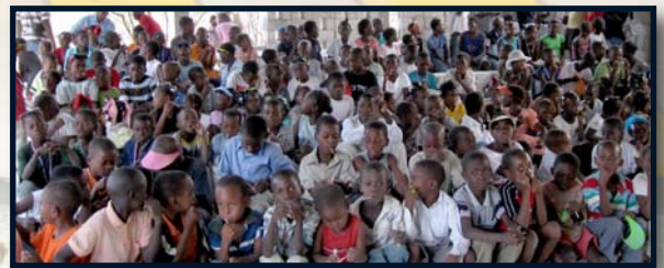
We had well over 70 young people dedicate their hearts to the Lord at our Vacation Bible School! Praise the Lord!