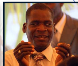
This dear brother is blind but he enjoyed praising the Lord!