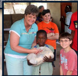
Our team enjoyed handing out hundreds of love bundles at Barbancourt.