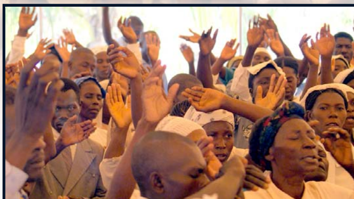
During the convention people came from miles around, some walking for many hours. It was a wonderful blessing to watch them lift their hands praising God and singing songs of worship. It reminded us that there is truly hope for Haiti if they will turn back to the Lord. We are seeing revival come to a land that seemed desolate.