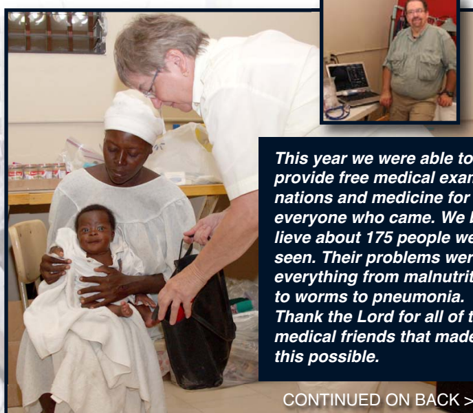
This year we were able to provide free medical examinations and medicine for everyone who came. We believe about 175 people were seen. Their problems were everything from malnutrition to worms to pneumonia. Thank the Lord for all of the medical friends that made this possible.